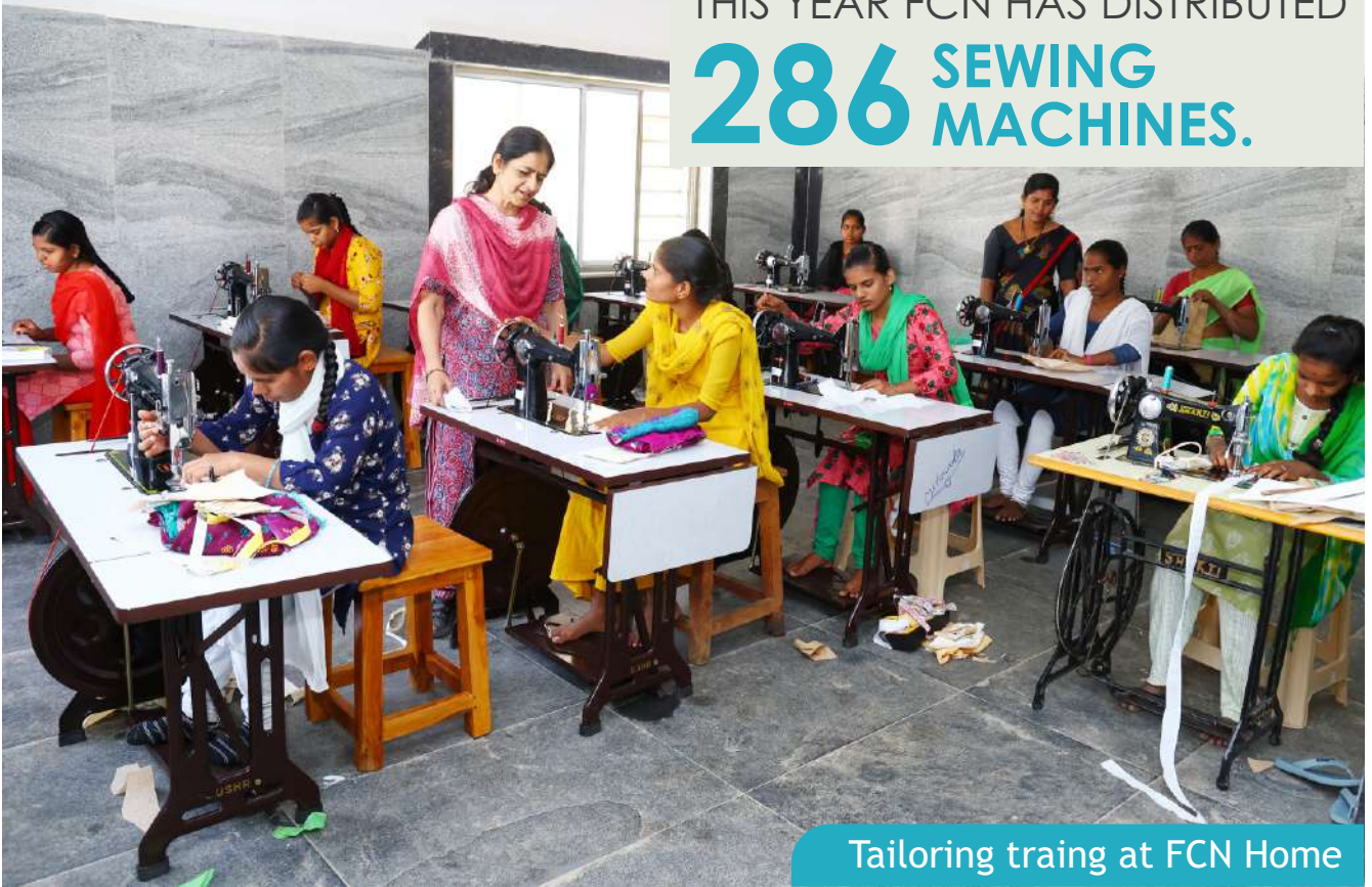
Tailoring traing at FCN Home

THIS YEAR FCN HAS DISTRIBUTED 286 SEWING MACHINES.