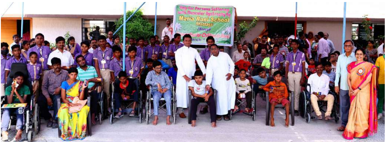
Financial Assistance to persons suffering from Muscular Dystrophy