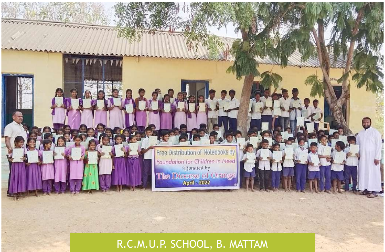
R.C.M.U.P. SCHOOL, B. MATTAM