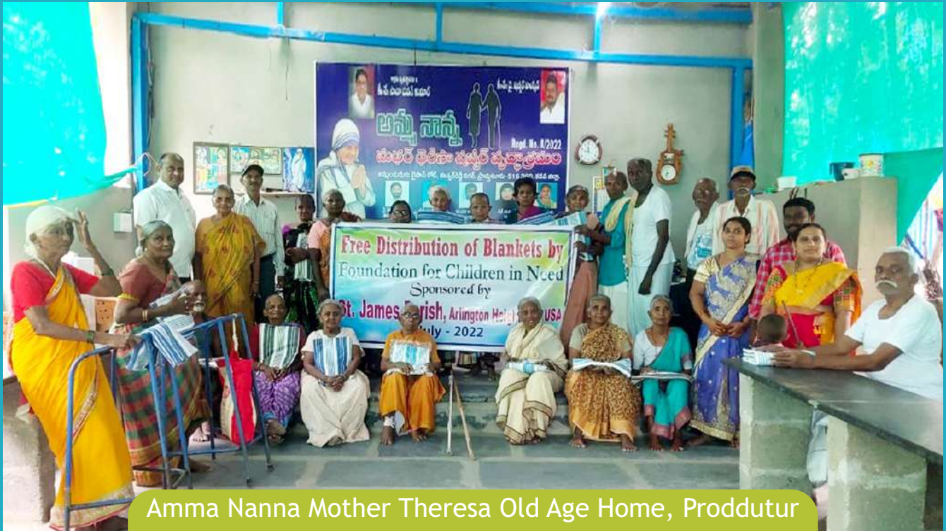
Amma Nanna Mother Theresa Old Age Home, Proddutur