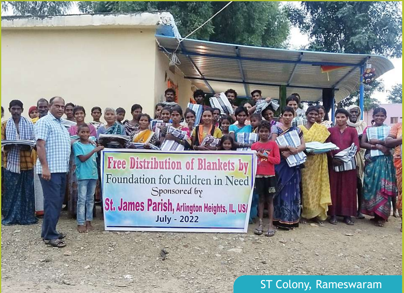
ST Colony, Rameswaram