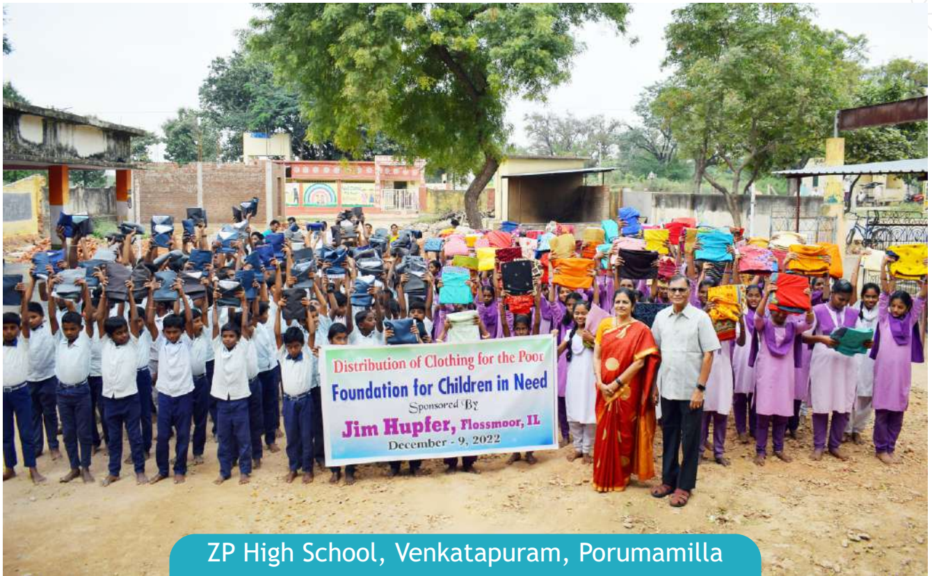
ZP High School, Venkatapuram, Porumamilla