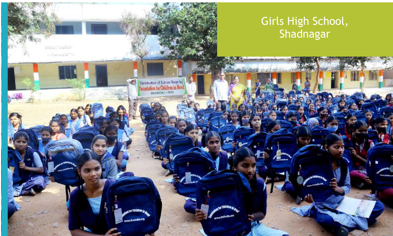
Girls High School, Shadnagar