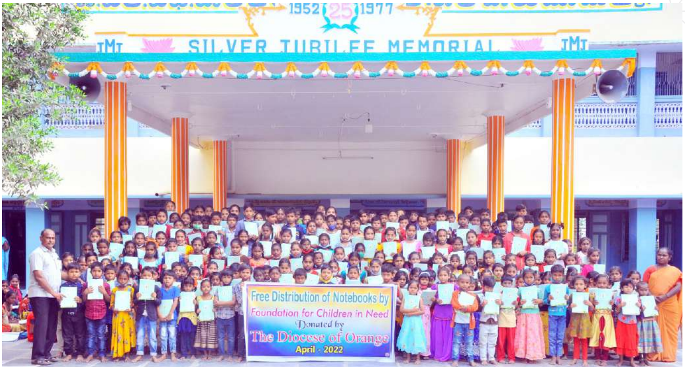
O.L.F. PRIMARY SCHOOL, PORUMAMILLA