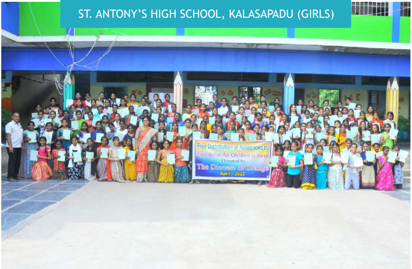
ST. ANTONY'S HIGH SCHOOL, KALASAPADU (GIRLS)