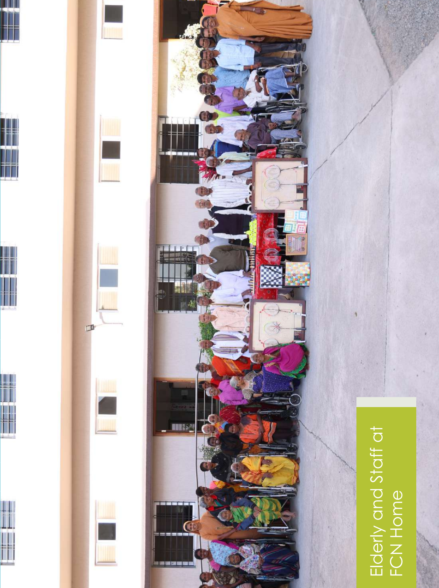
Elderly and Staff at FCN Home