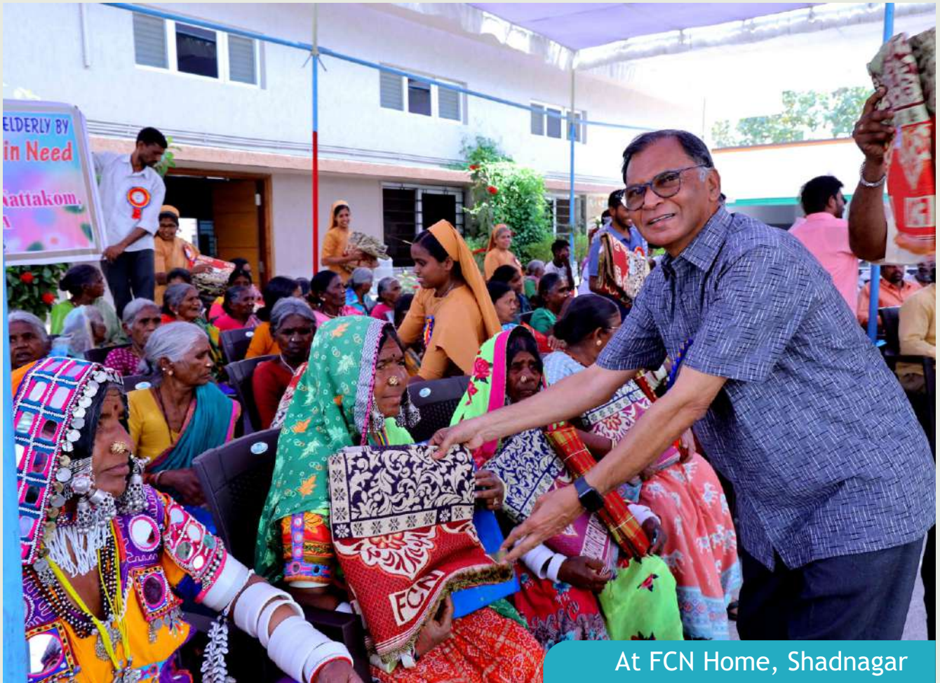
At FCN Home, Shadnagar