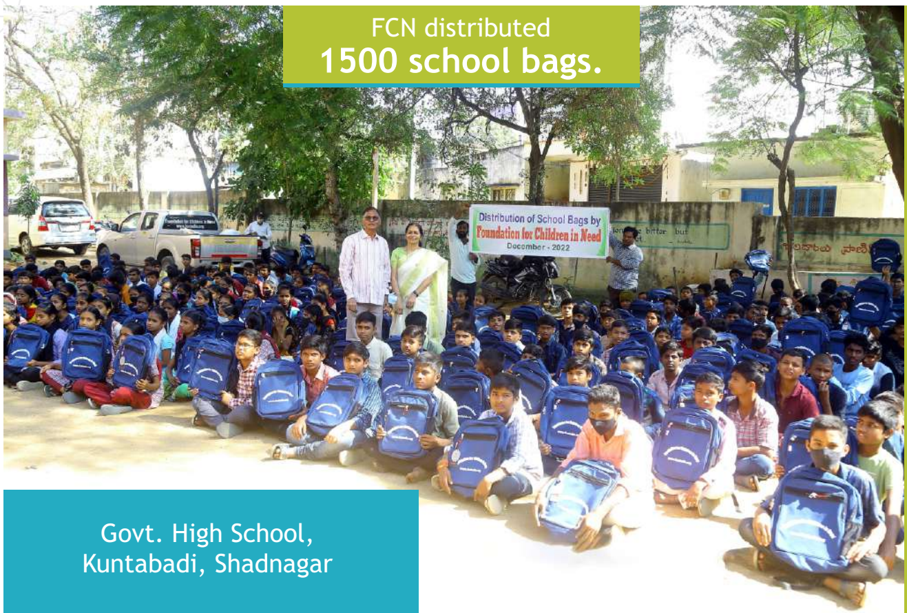
Govt. High School, Kuntabadi, Shadnagar