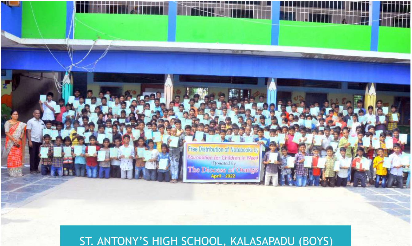
ST. ANTONY'S HIGH SCHOOL, KALASAPADU (BOYS)