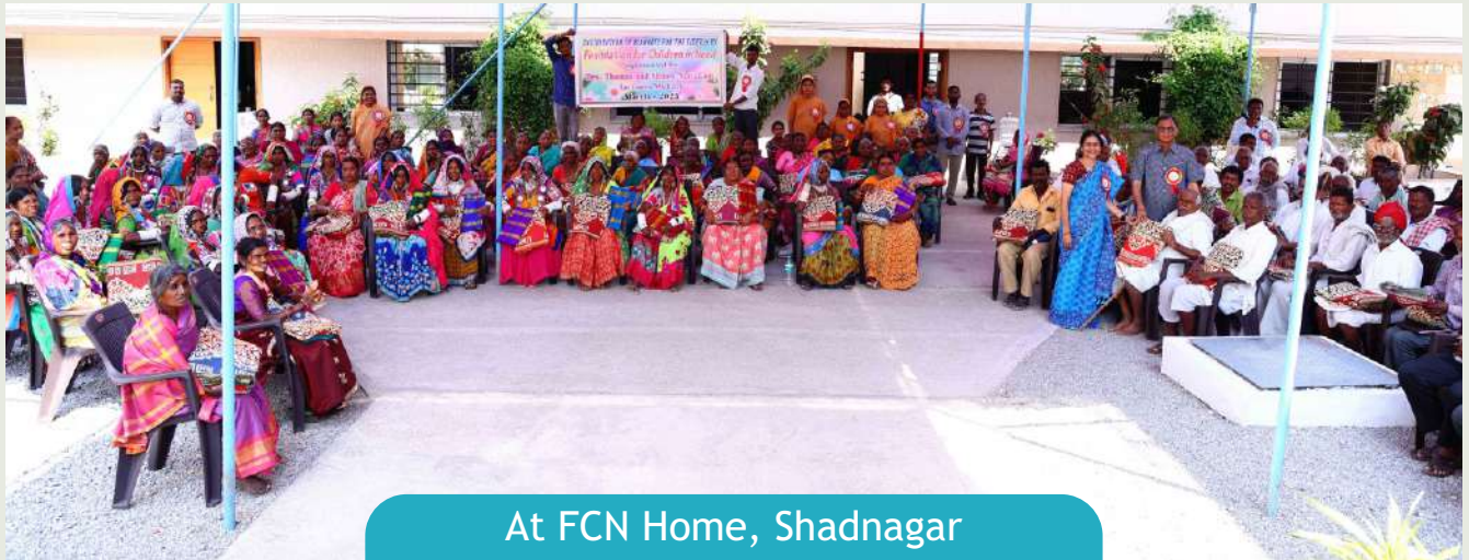
At FCN Home, Shadnagar