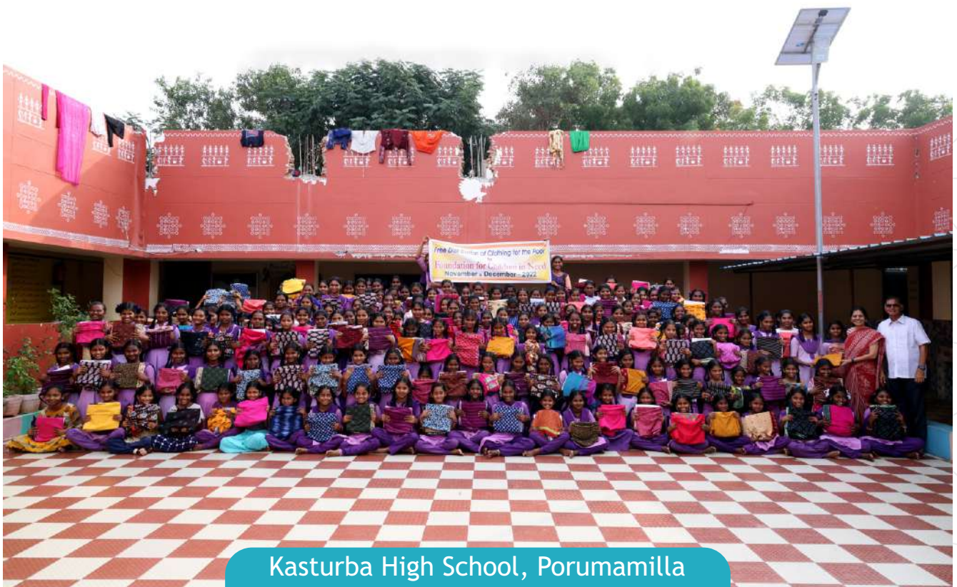
Kasturba High School, Porumamilla