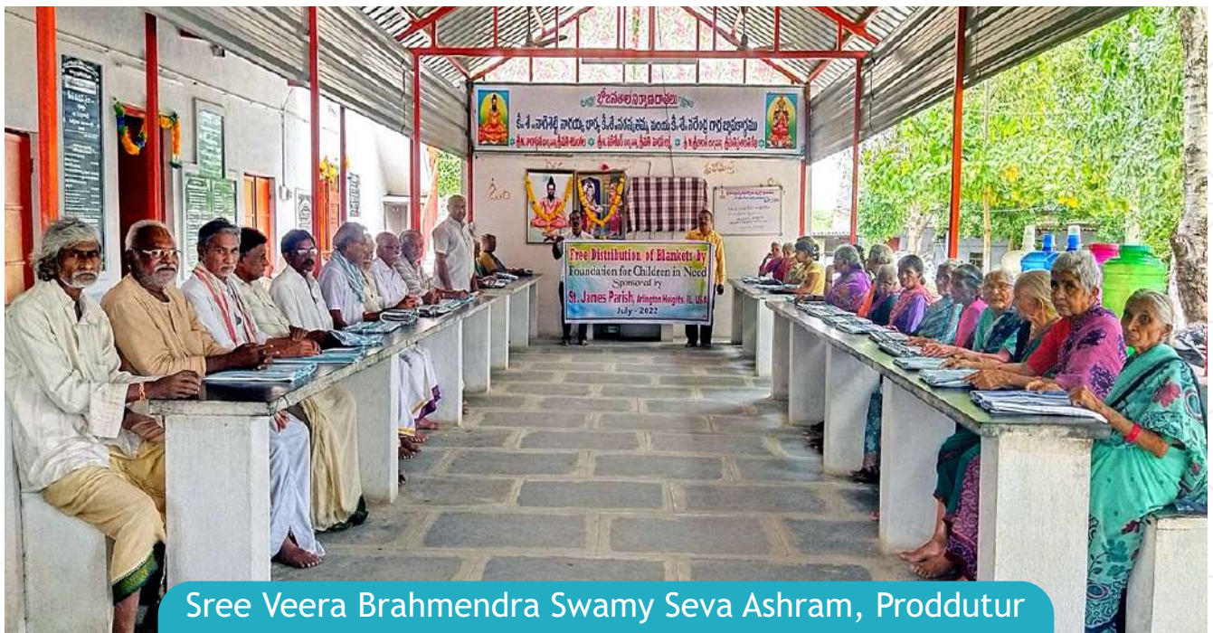
Sree Veera Brahmendra Swamy Seva Ashram, Proddutur