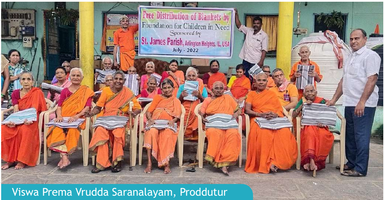
Viswa Prema Vrudda Saranalayam, Proddutur