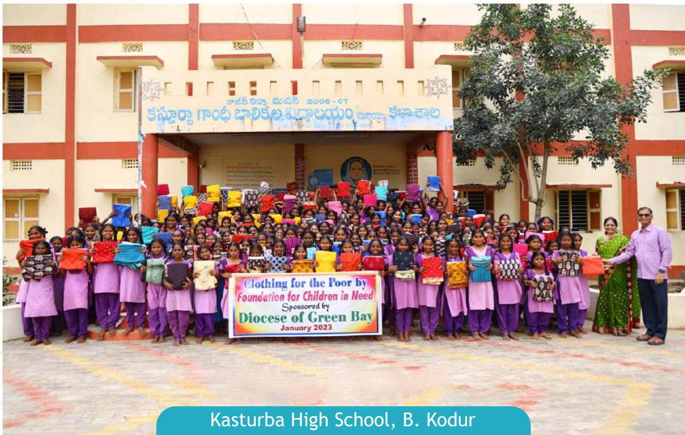
Kasturba High School, B. Kodur