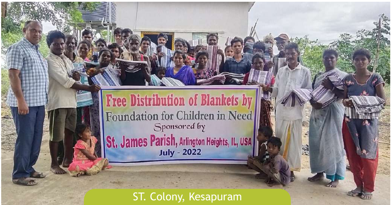
ST. Colony, Kesapuram