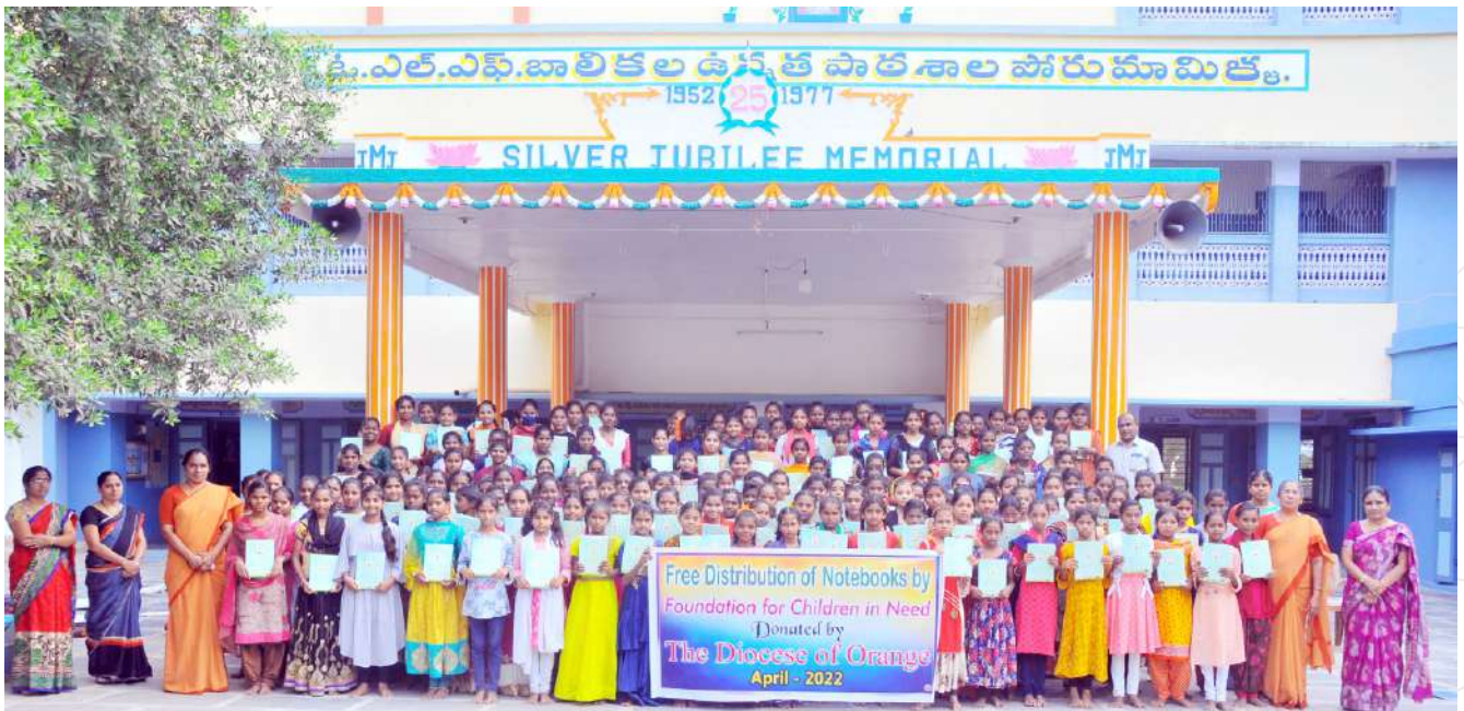
O.L.F. HIGH SCHOOL, PORUMAMILLA