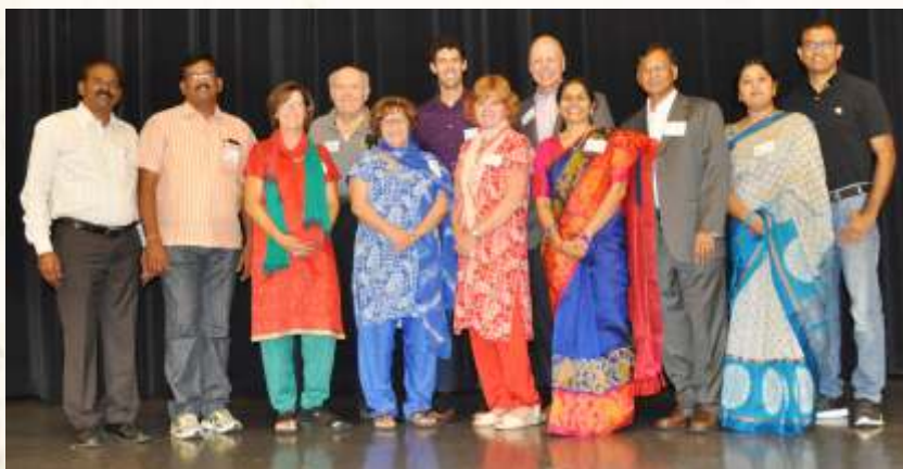
FCN Board of Directors with FCN India core team - 2017