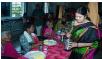
Serving the elderly at FCN Home