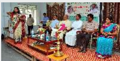
At Universal College of Engineering-2013