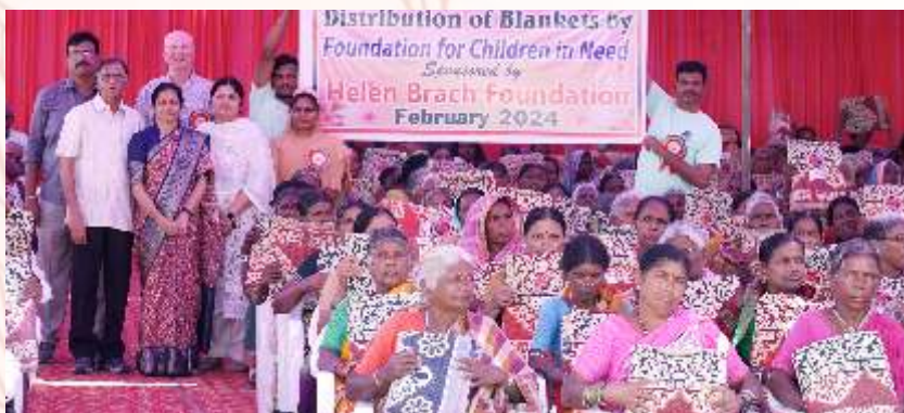
Parneetha Distributing Blankets to the Elderly-Feb 22, 2024