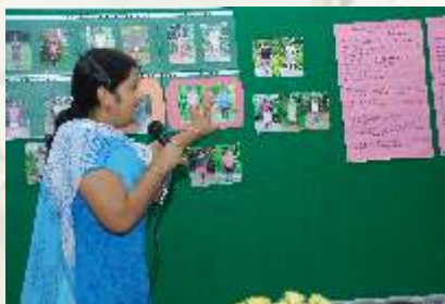
Explaining to FCN Project coordinators about the importance of good photos