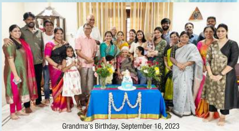
Grandma's Birthday, September 16, 2023