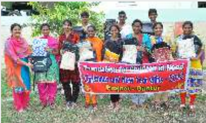
Pari distributing gifts