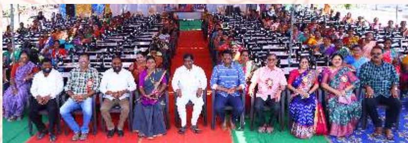
Distribution of Sewing machines at FCN Home Shadnagar