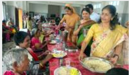
Parneeetha serving food at FCN Home