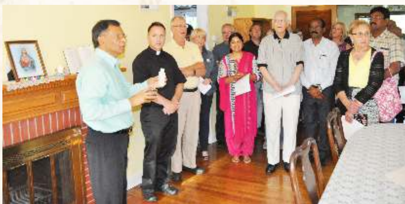
Parneetha at the blessing of FCN Office in Chicago-2017