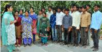
Parneeetha talking to FCN Sponsored College students