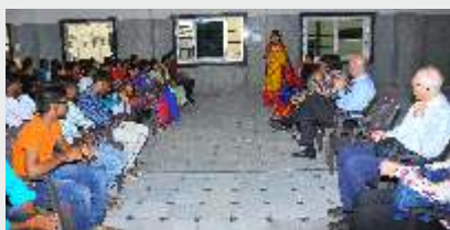
Addressing the college students-2019