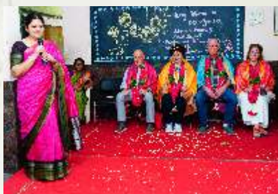
Introducing the sponsors at Father Francis Memorial School- January 2024