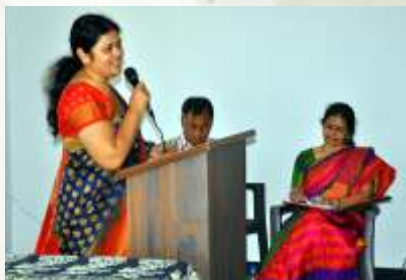
Addressing the FCN Project Coordinators